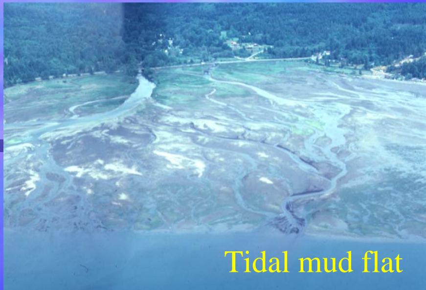
Tidal mud flat