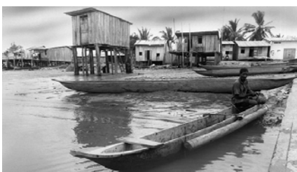
Ecuador Commercial Fishing Village