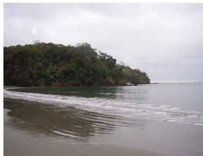
Ecuador Coast, South of the San Francisco Peninsula

The whole effort is being discussed by an inter-institutional panel that includes the Ministry of Environment, Ministry of Agriculture and Fisheries, Ministry of National Defense, Ministry of Tourism, the municipality of Muisne, the provincial government, the community and local NGOs supported by CI and TNC.